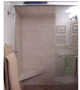
This recently updated washroom has a spacious stand-up shower, with a bench (pictured above).